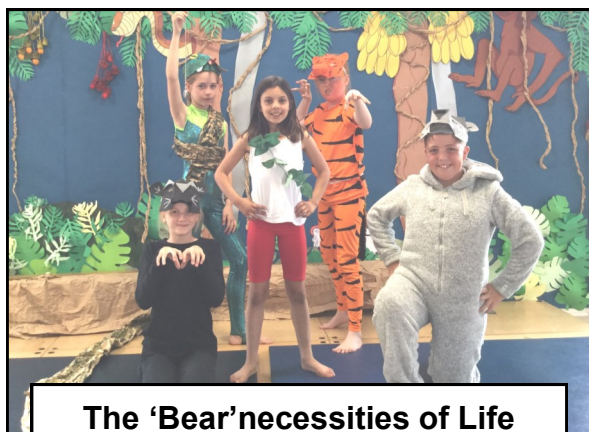
The 'Bear' necessities of Life

Letters sent home this week: All - School reports