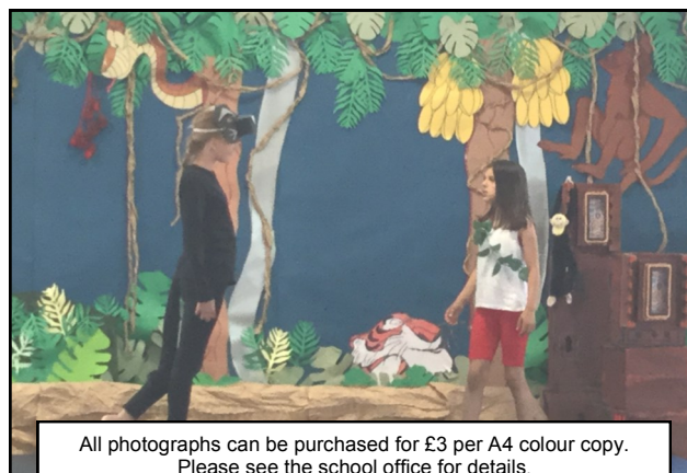
All photographs can be purchased for £3 per A4 colour copy. Please see the school office for details.