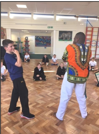
We enjoyed recognising Black History week.