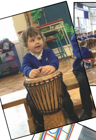
Djembe drumming was great fun for all!