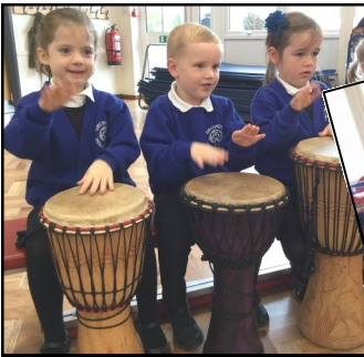
This week Red Panda Performance group visited us at school.