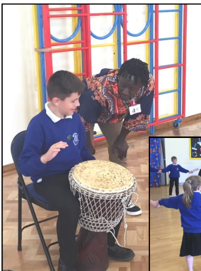
African Dancing to the Djembe rhythms