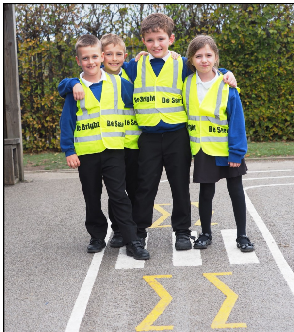
Children practising road safety messages using our new road safety playground markings.

All photographs can be purchased for £3 per A4 colour copy. Please see ParentPay for details.