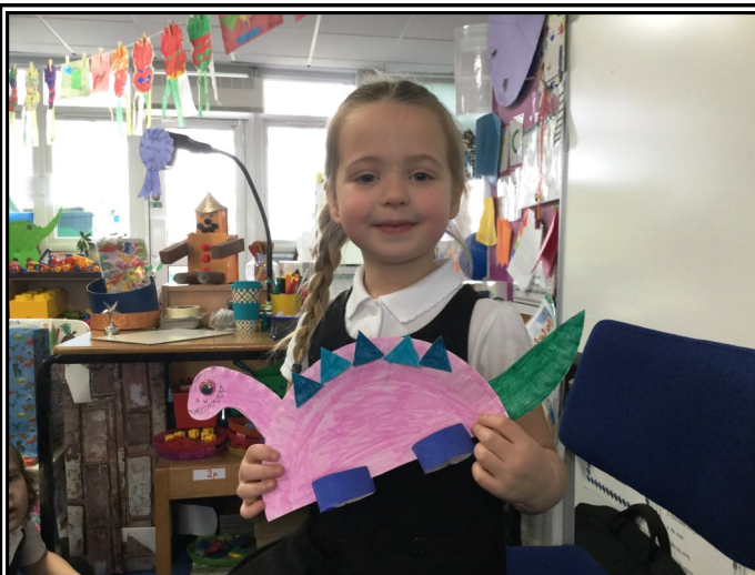
Dinosaur Experts in Reception

Do not forget Tickets go on sale for the Chocolate Bingo Night on Monday at 8.30 am in the Conference Room. Just £1 per ticket which includes the first book. Tickets will be on sale Monday, Tuesday and Wednesday between these times 8.30-9am and 3.00-3.30pm. If you are not able to purchase tickets in person but would still like to attend please email tbps2619@welearn365.com or text 07919 431220