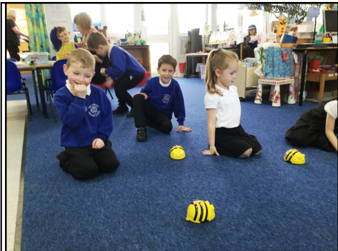
'Bee Bots' causing a buzz in Reception

Our 'excellent attendance' certificates are not only awarded for perfect attendance, but take account of one or two days off, to ensure that children do not come in unwell just to gain a certificate.