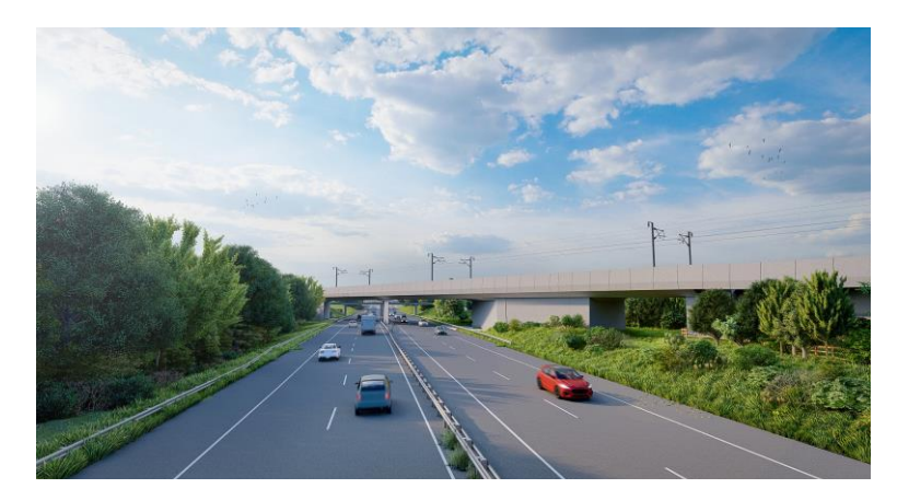
Proposed view of the M42 Marston Box structure, looking south west along the M42.

For more information on these works please visit: www.hs2.org.uk/marston-box