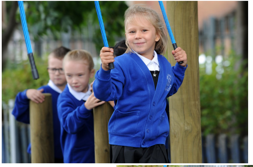
A brand new trim trail had been installed alongside the lower school playground

The children have had lots of fun using the new equipment.